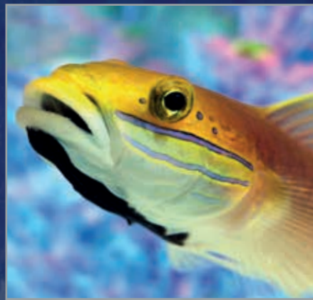
Cover: Valencienna bella (J. Clipperton)