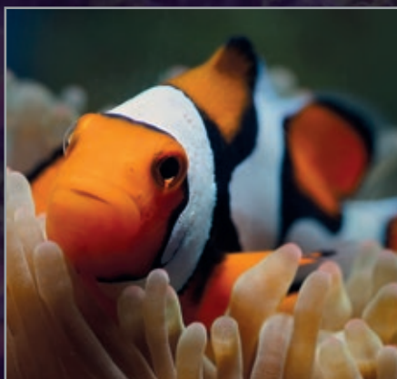
Cover: - Clownfish in Anemone (J. Clipperton)