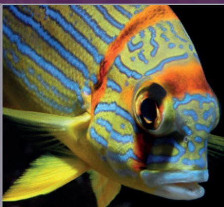
Cover: Symphorichthys spilurus